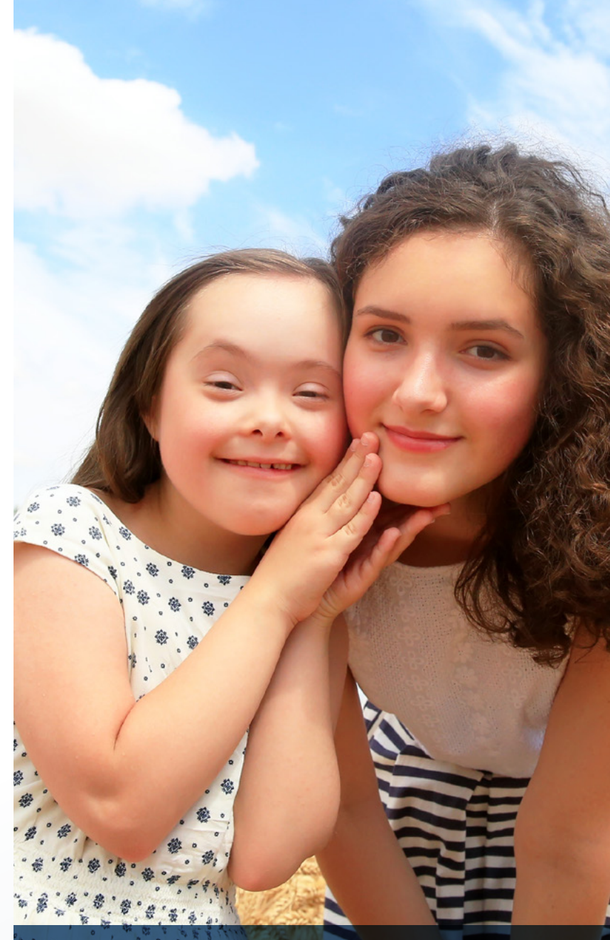
We carefully screen our Personal Care Workers so you're assigned the ideal caregiver for you or your loved one.

Today, we work with many care coordinators and case managers from different health plans, managed care organizations, clinics, and others. They like to work with us because they know we conduct all our affairs properly and can always provide staff for their clients.